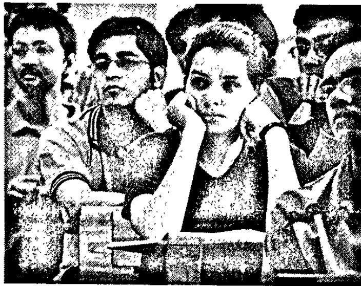
Company expects its revenue from corporate training to contribute a fourth of overall revenue in the next years from 15% at present

In all these verticals, Manipal will have corporate tie ups offering diplomas, certificate